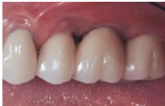
Figure 7F —Case complete clinical view of the immediate restored implants placed in conjunction with sinus elevation surgery at 5½ months.