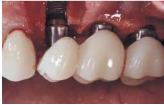
Figure 7D —Abutments seated and conversion of the TempStent™ into the provisional restoration.

After atraumatic coring procedures, and application of PRP in the osteotomy sites, placement of the implants is accomplished. Two Paragon Tapered Screw Vents ® are placed: a 5.7-mm diameter, 13-mm length implant at the No. 19 position, and a 4.7-mm diameter, 13-mm length implant at the No. 20 position. The creation of the sculpted implant receptacle site eliminates the countersinking procedure, and allows the implant collar to remain above the crest of the bone, but within the environment of the interdental bone height (Figure 6C). After preparing and polishing two HLA abutments ® , a 4/5 and 5/6 at the appropriate implant sites, placement of the abutments (Figure 6C) precedes retrofitting and marginal adaptation of the provisional restorations. Closure is accomplished with 4.0 Vicryl Rapide suture in a continuous sling/horizontal mattress suturing technique (Figure 6D). Evaluation of the patient's occlusion confirms no occlusal contact in centric relation or lateral excursive movements.