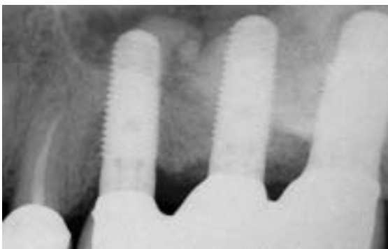
Figure 7G —Case complete periapical radiograph.

implant carriers, the preprepared HLA stock abutments are seated, and the provisional restoration is inserted to confirm implant placement, before retrofitting with a composite material (Figure 7D). After the conversion of the surgical guide to the provisional restoration, cementation of the restoration is achieved with a strong temporary cement. Application of PRP over the lateral aspect of the maxillae precedes additional grafting with the PRP/PepGen™ graft complex at the osteotomy site in the lateral wall of the maxillae, and the peri-implant defect sites. Closure is accomplished with 4.0 Vicryl Rapide sutures (Figure 7E). Note that in centric occlusion, disclusion is present from Nos. 13 to 15. In the normal chewing cycle, small amounts of load will undoubtedly be present, and the author observes that enhancement of the maturation phase of the graft occurs, based on earlier definitive load times.