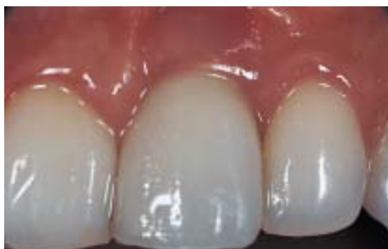
Figure 5G —Final implant-supported restoration.

restoration can be cemented with a temporary cement, and once again, confirmation of non-load can be obtained.