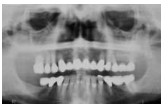
Figure 7B —Preoperative panoramic view, maxillary left posterior sextant.

and correction of the fenestration at the facial of tooth No. 9, with a PRP/PepGen P-15™ graft complex f , provide the foundation for regeneration of the insufficient alveolar buccal crest. Creation of a bioactive membrane by application of PRP, followed by platelet-poor plasma (PPP) over the entire graft complex and surgical site, aids in the local delivery of growth factors to the bone surface, implant surface, and inferior surface of the flap. Closure is accomplished with 5.0 Monocryl suture and a bioactive wound dressing created by additional application of PRP and PPP over the surgical site before dismissal. After 3 months, the removal of the temporary allows not only for the final torquing of the stock abutment to 30 Ncm, but also for inspection of the sulcular environment and emergence profile created (Figure 5F).