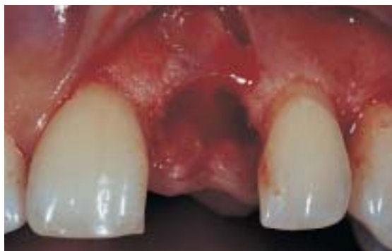
Figure 5C —Creation of the sculpted implant receptacle site with PRP inserted into the osteotomy site.