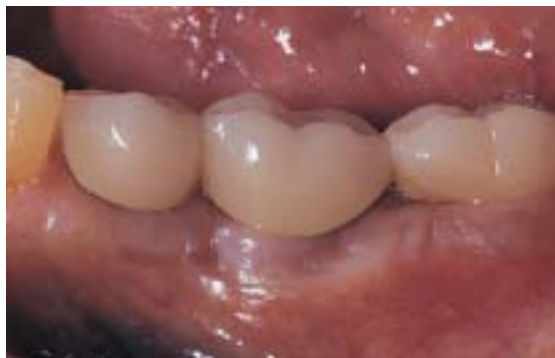
Figure 6E —Case complete clinical appearance of three immediate restored implants at 4 months after surgery.