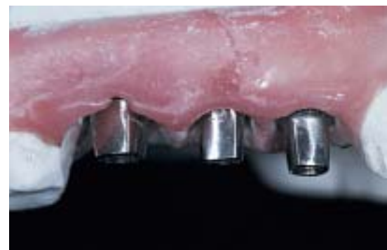
Figure 4—Preparation of stock abutments on the TempStent™ model.

tapered, which provides the best chance for obliterations of the coronal portion of the socket. It also mimics the natural convergence, which occurs in the natural tooth system, to the apical portion of the socket. The implant surface should be roughened with surface enhancements to promote a rapid integration and to enhance the initial stabilization of the fixture. The polished implant collar should be \leq 1 mm in height, which allows the final position of the implant collar to be at a position that is superior to the crest of the bone. This position allows soft tissue attachment in the region of the collar. The roughened implant surface at the first thread, or at its smooth transfer from the polished collar to the roughened surface, allows bone attachment. Placing the implant in this fashion eliminates the “dieback” phenomenon.