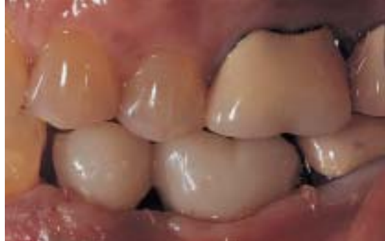
Figure 6D —Closure and the left lateral clinical view.

techniques at fixture level with a transfer coping. When fabrication of the custom abutment is completed, the abutment is seated and torqued at 30 Ncm, and completion of the implant supported restoration proceeds as normal.