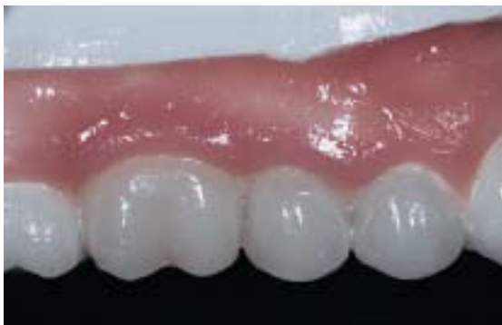
Figure 1—Diagnostic wax-up.