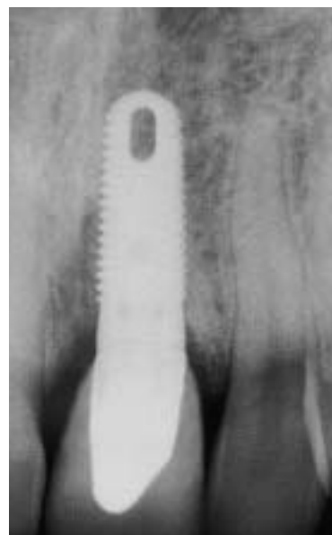
Figure 5H —Case complete peri-apical radiograph.

edentulous ridge cases, and 4 to 5 months in sinus grafted cases. After 3 to 5 months, if the restorative clinician uses the stock abutment seated at the initial visit, the abutment is torqued to 30 Ncm, and the temporary is re-cemented. Routine restorative procedures are followed from that point.