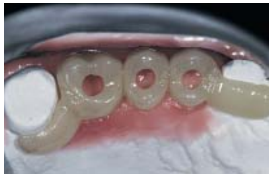
Figure 2—TempStent™ surgical stent/provisionalization system.