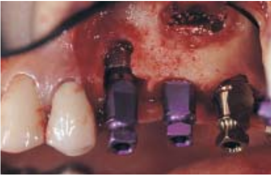
Figure 7C —Implant placement in conjunction with sinus elevation surgery.