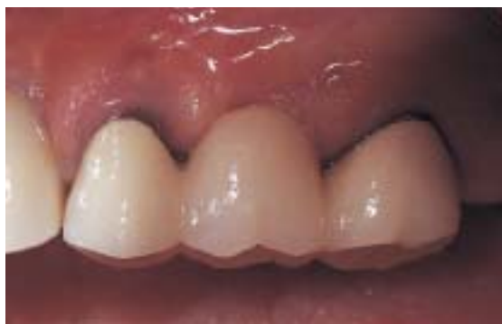
Figure 7A —Preoperative clinical view, maxillary left posterior sextant.