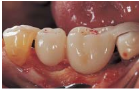
Figure 6B —TempStent™ seated clinically after creation of the sculpted implant receptacle site.