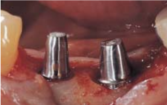
Figure 6C —Seating the prepared, polished stock abutments.