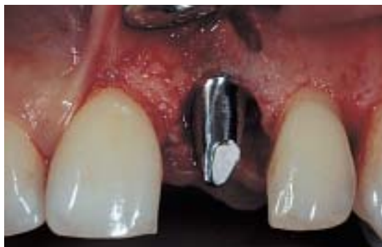
Figure 5D —Prepared, polished stock abutment seated.