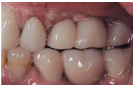
Figure 7E —Closure and left lateral centric occlusion view.