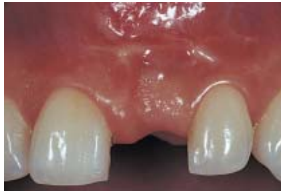
Figure 5A —Pretreatment view of edentulous site at tooth No. 8.

Abutment selection is achieved by using the carrier mechanism of the implant system (a temporary abutment) or a stock abutment (which the restorative dentist could use as a final abutment). Both of these require preparation. The incorporation of the temporary/surgical guide system, which the author uses, allows advance preparation of the stock abutment in the dental laboratory. This eliminates the repeated removal of carrier mechanisms, intraoral preparation of the abutment (which produces heat and micro-movement via vibration), and impression copings for implant indexing at the time of placement. It is important to remember that many times, with immediate tooth removal/immediate implant placement (especially in sinus elevations), the quality of bone is compromised. Whatever the surgeon can do to minimize external forces to the fixture is beneficial. A stock-angled abutment that is easily prepared