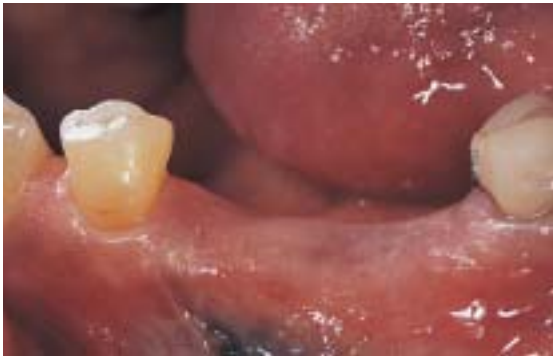
Figure 6A —Preoperative view of the mandibular left posterior sextant at teeth Nos. 19 and 20.