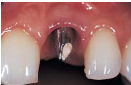
Figure 5F —Emergence profile formation at 3 months postoperatively.