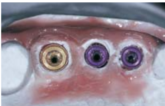
Figure 3—Analogues set into maxillary study cast.