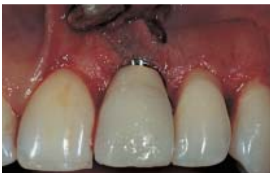
Figure 5E —Provisional restoration cemented.